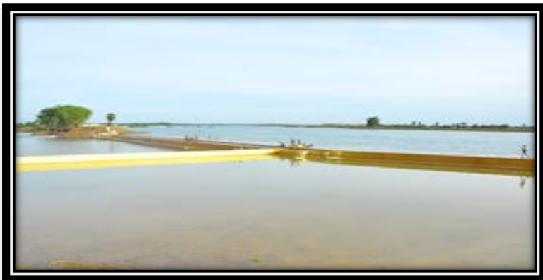
De-silting of Walajah Lake