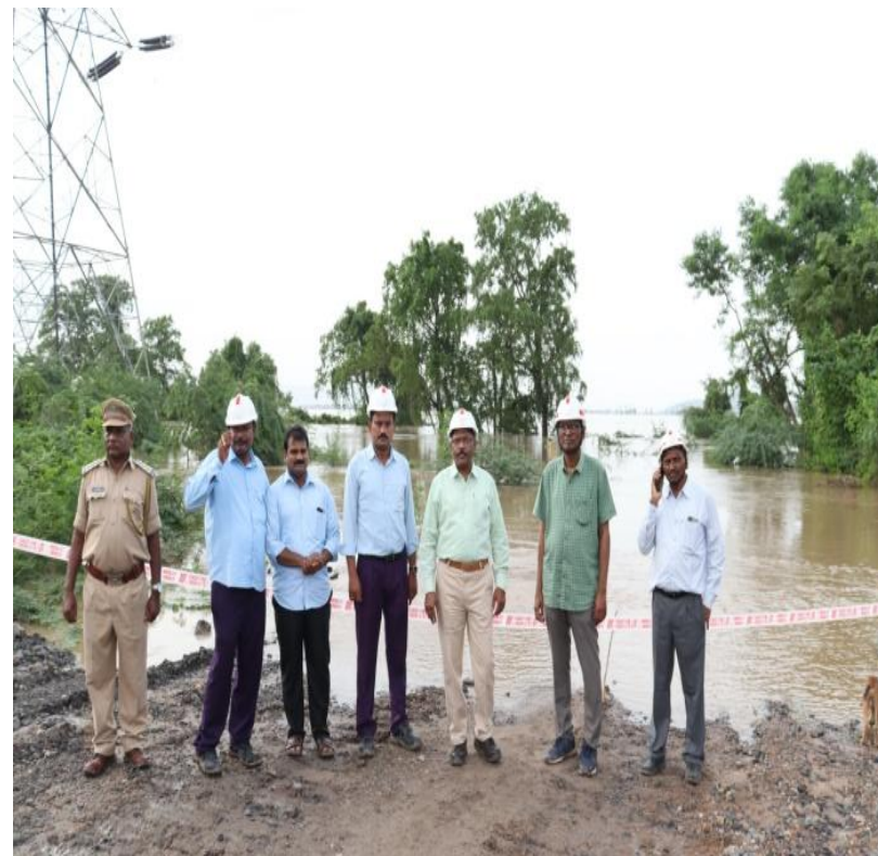
Visit of flood affected area by SCCL officers in Bhadrachalam