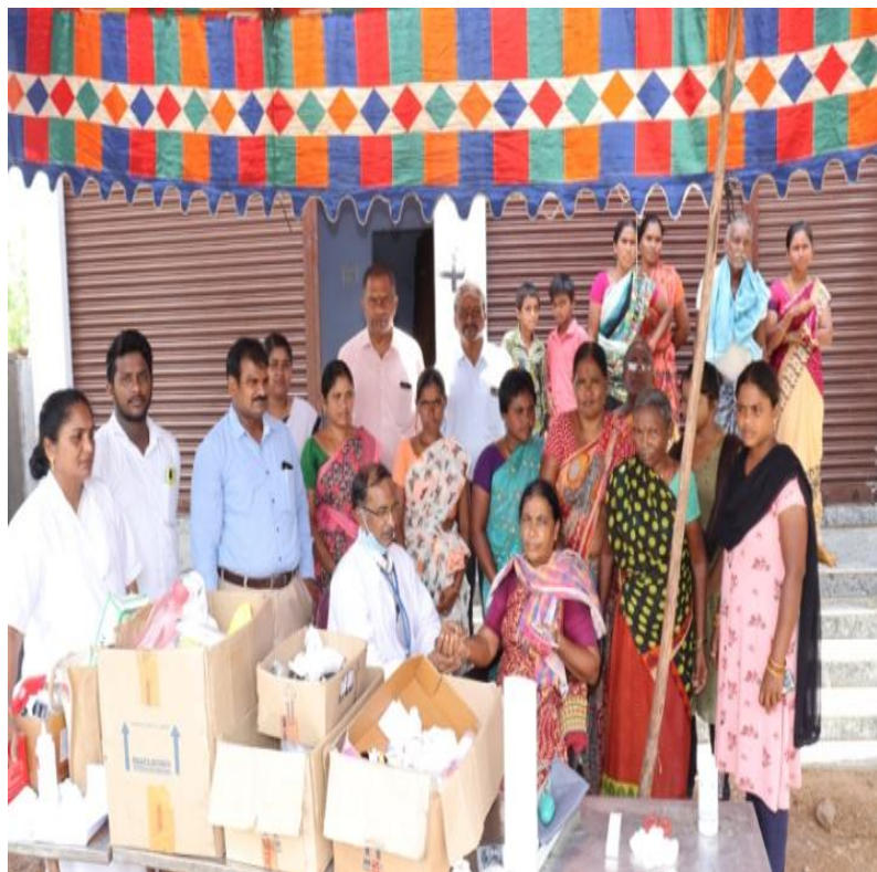
Organized medical camp for flood affected people in surrounding villages of Bhadrachalam