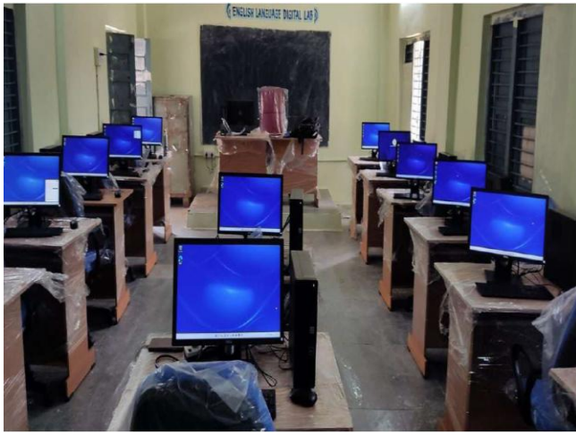
Provided English Language Digital Lab in Telangana State Residential School for Boys in Sarvail