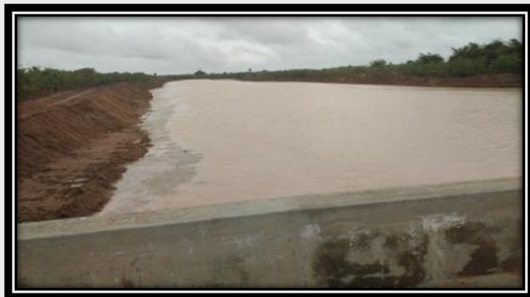
Widening, De-silting Of Sengal Odai & Middle Paravanar