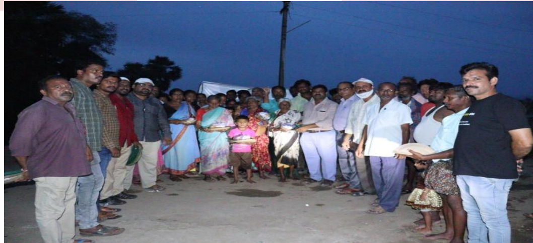
Distribution of food packets in flood affected people in surrounding villages of Bhadrachalam