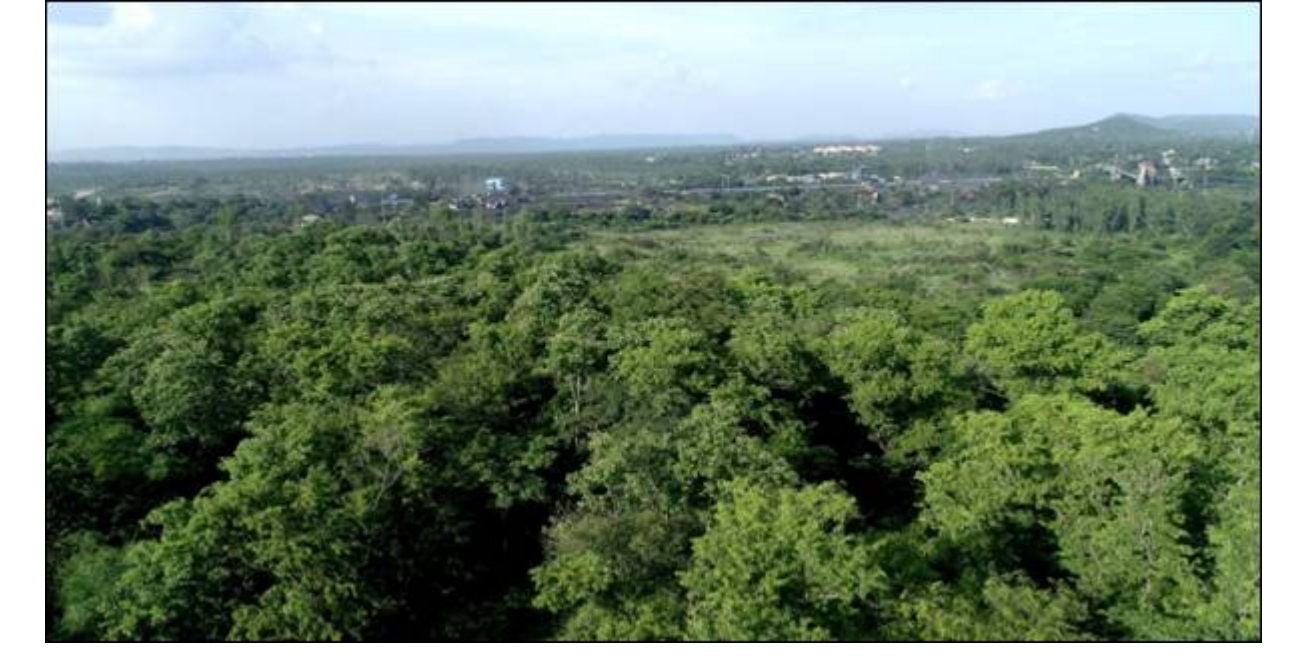
Plantation at NK Area, CCL

Over the past five years (FY 2019-20 to FY 2023-24 till January), Coal/Lignite PSUs have planted more than 235 lakh saplings over an area exceeding 10,784 Ha, thus enhancing the carbon sink significantly. To monitor reclamation performance, Coal/Lignite PSUs employs satellite surveillance.