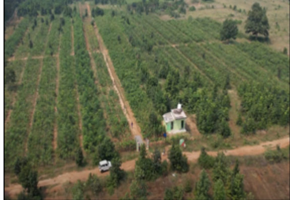
Miyawaki Plantation in MCL

The plantation initiatives not only mitigate the ecological impact of mining activities but also contribute to the restoration of biodiversity, enhancement of ecosystem services, creating carbon sinks, providing livelihood opportunities for local communities and promotion of sustainable development. By leveraging scientific expertise, community engagement, and innovative methods like Miyawaki plantation, Coal/Lignite PSUs are creating a legacy of green, resilient landscapes for future generations.