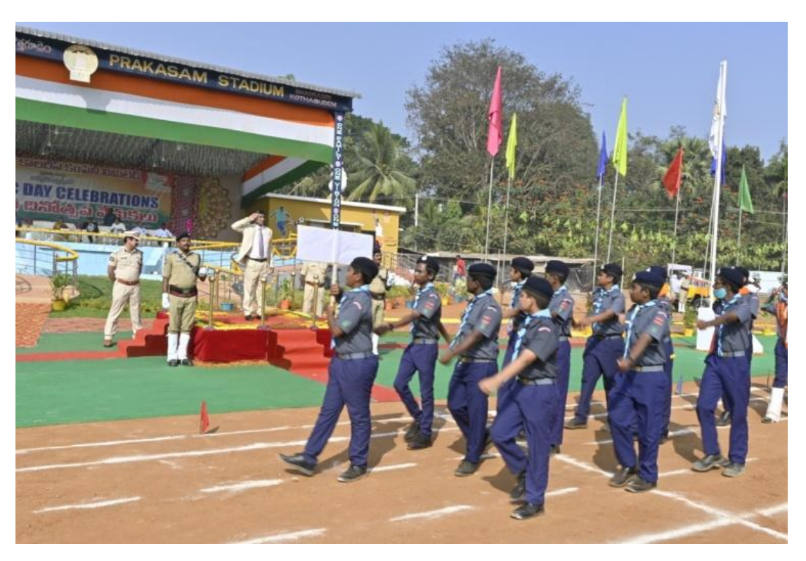
Republic day parade by Scouts and guides