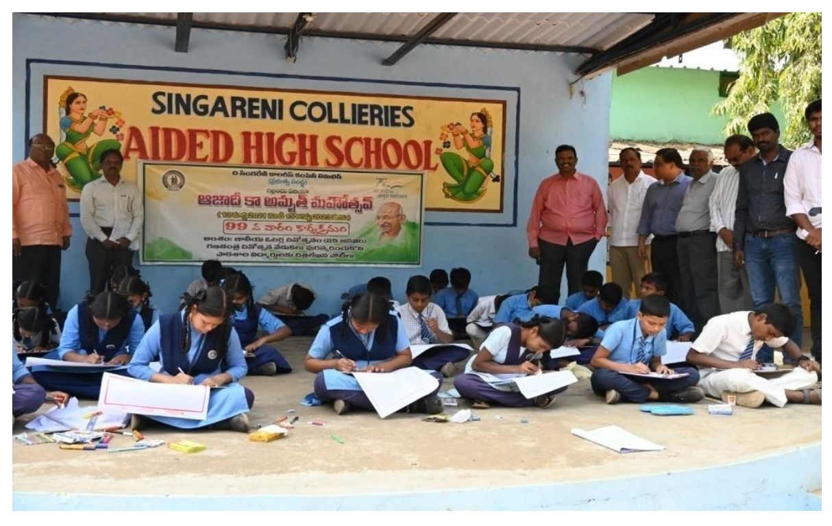
Essay writing competitions on eve of Republic day