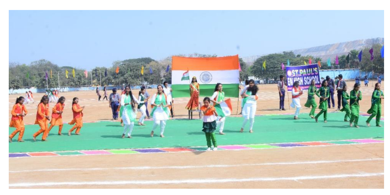
Students participated in cultural programmes on eve of Republic day