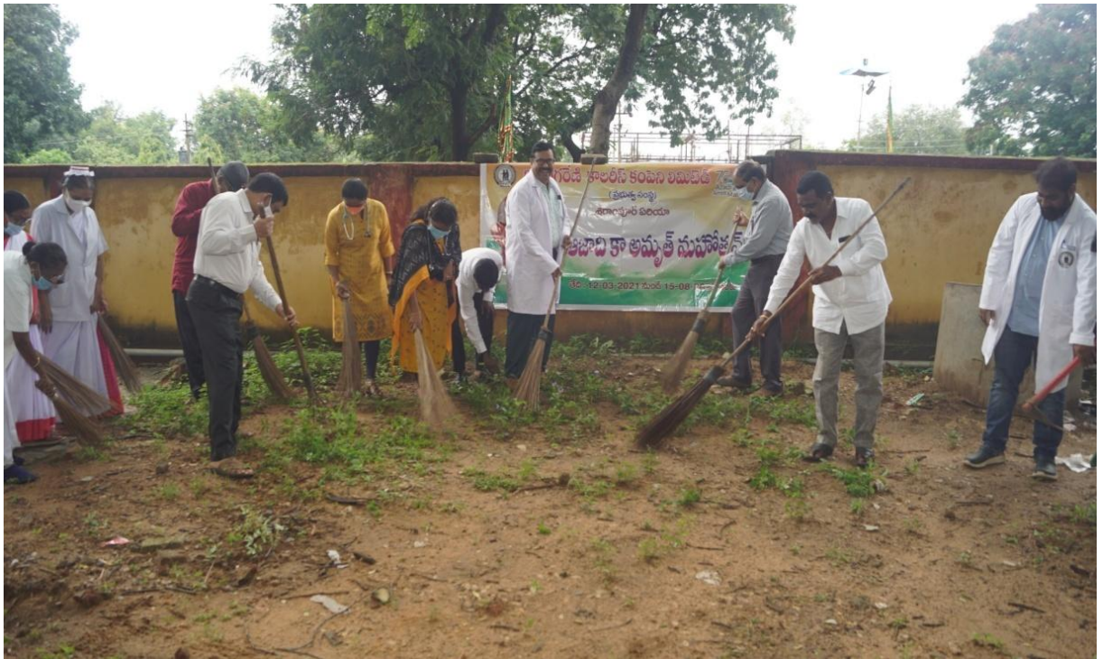
Doctors and employees participated in cleaning programme in Srirampur area