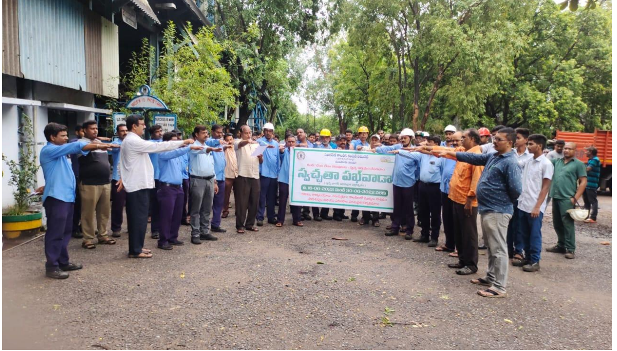
Swachhta Pledge in Manuguru Area