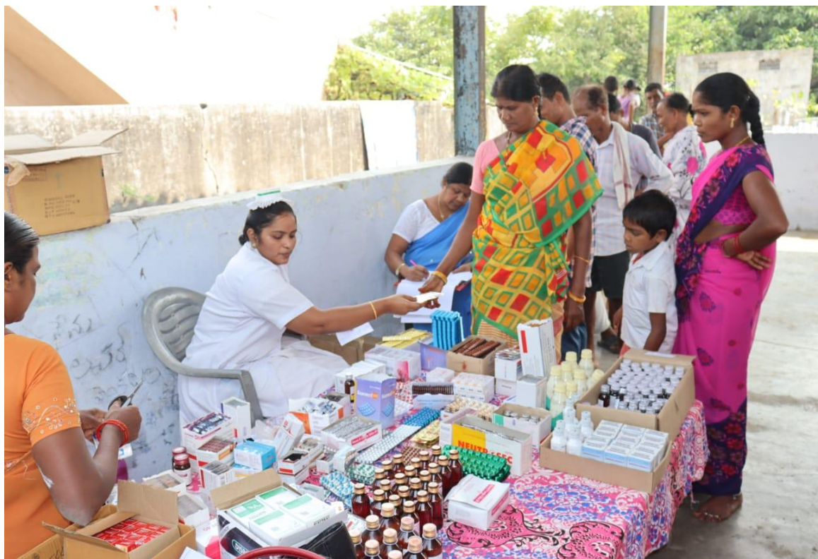
Distribution of medicines on free of cost to the patients.