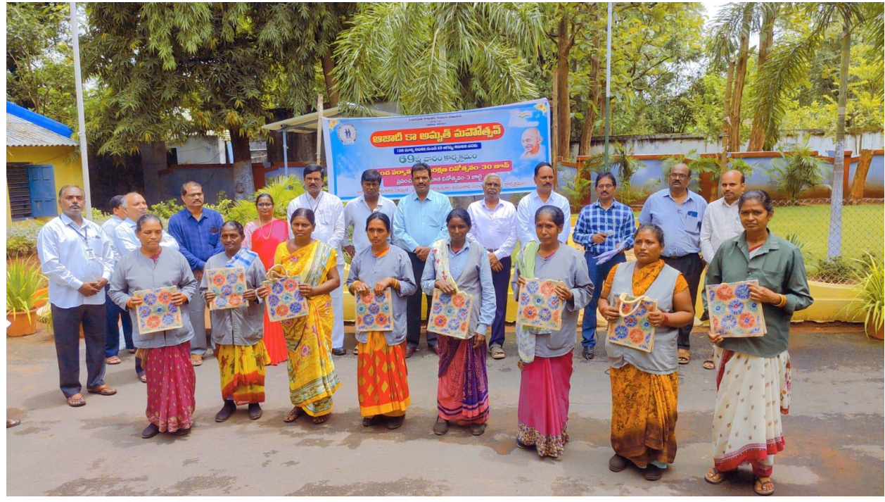
Distribution of jute bags to the employees in Yellandu area