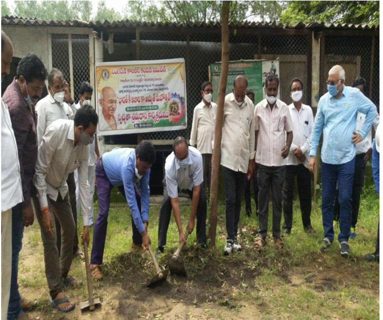
General Manager participating in Cleaning the Mine premises of KK-5 Incline, Mandamarri area