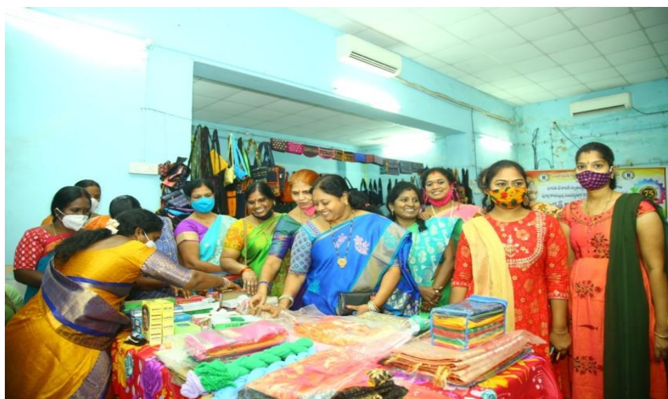
Visiting of exhibition stalls of Art crafts on 25.3.2021 by President, SEWA, Mandamarri Area organized by self employment groups of Singareni Seva Samithi (SSS)