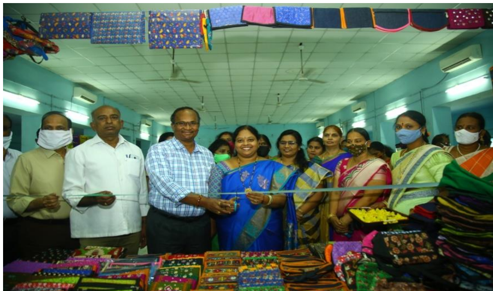
Inauguration of exhibition stalls of Art crafts on 25.3.2021 by General Manager, Mandamarri Area organized by self employment groups of Singareni Seva Samithi(SSS), Mandamarri Area