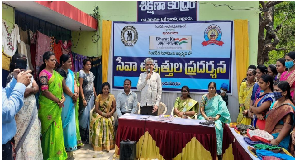
General Manager., Yellandu Area, visiting exhibition stalls of Art crafts on 28.3.2021 organized by self employment groups of Singareni Seva Samithi (SSS), Yellandu Area