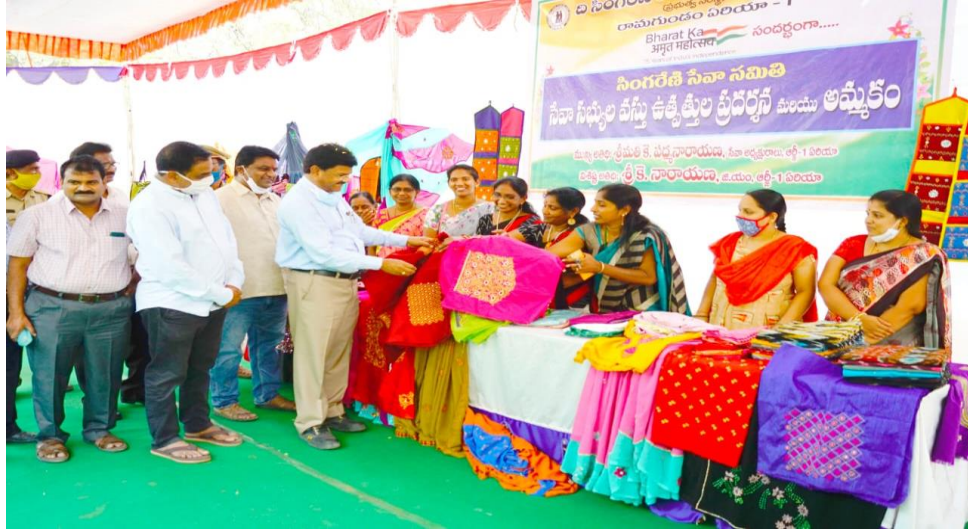
General Manger, Ramagundam -1 Area, visiting exhibition stalls of Art crafts on 27.3.2021 organized by self employment groups of Singareni Seva Samithi(SSS), RG-1 Area