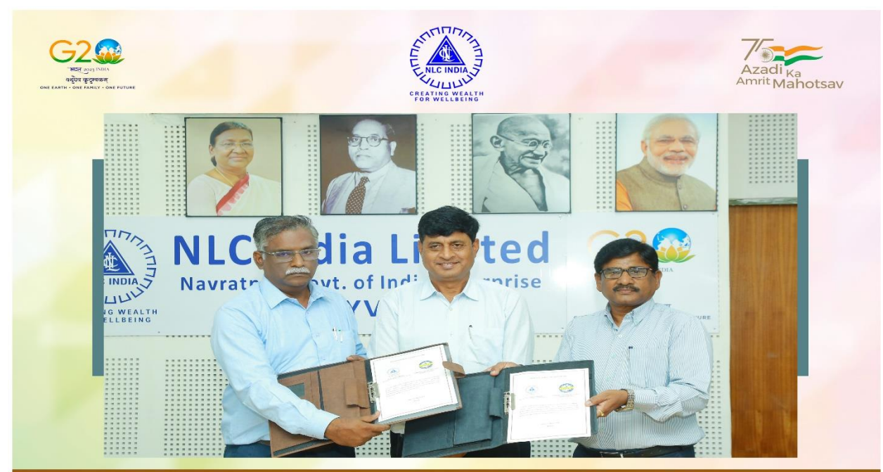
NLCIL INKS PACT WITH TWAD BOARD FOR THE COMBINED WATER SUPPLY SCHEME FOR CUDDALORE DISTRICT

NLC India Limited executed an MoU for yet another community development initiative to supply 425 Lakh Litres of water per day to Tamil Nadu Water Supply and Drainage Board for the Cuddalore District Combined Water Supply Scheme, benefitting 7.91 Lakh People as a part of "Azadi Ka Amrit Mahotsav" theme for creating awareness as advised by Ministry of Home Affairs, Govt. of India by following the preventive measures as maintaining social distancing, wearing of Mask etc.