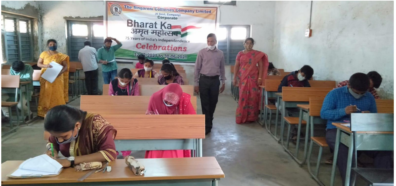
Essay writing competitions conducted on eve of National Science Day in Mandamarri area