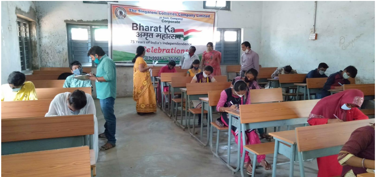
Essay writing competitions conducted on eve of National Science Day in Kothagudem