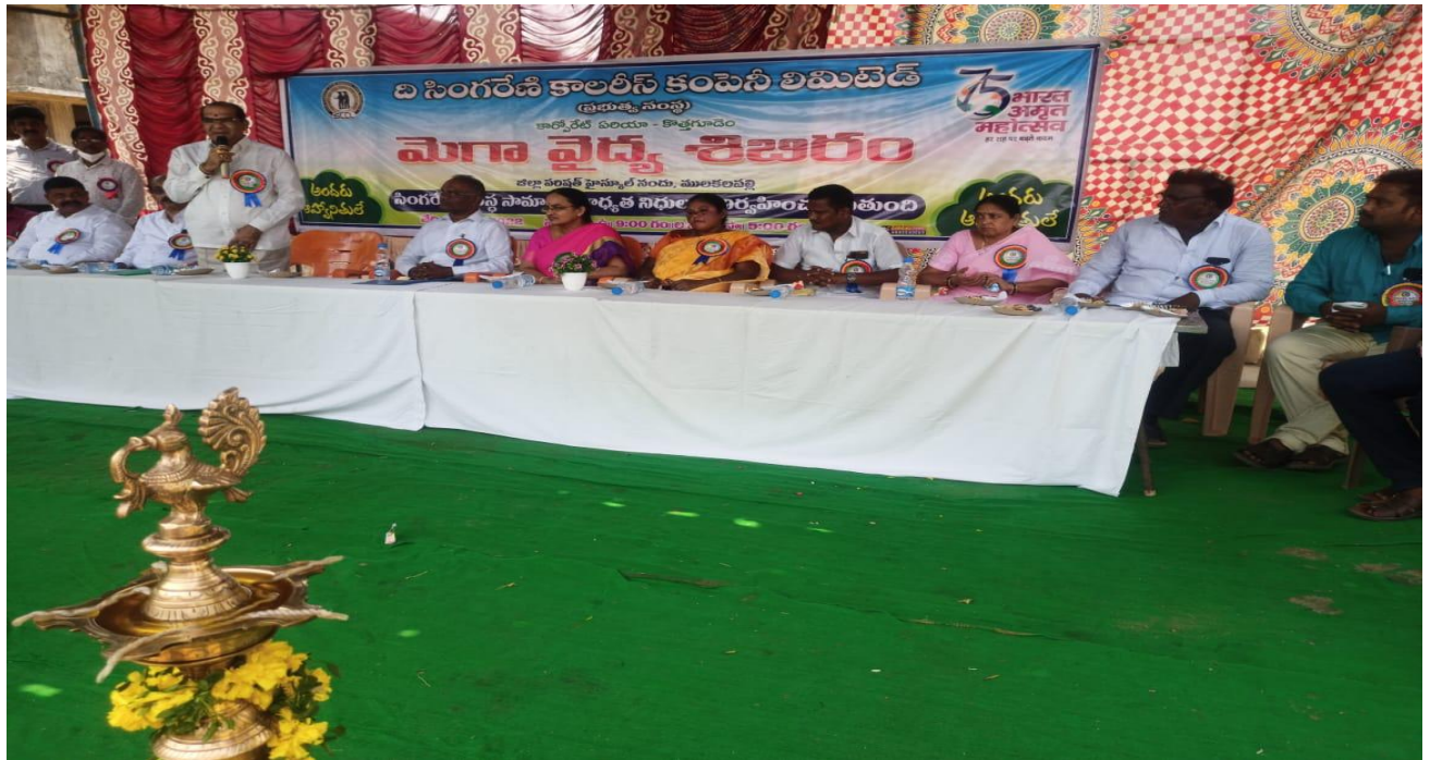
Dignitaries addressing the program during inauguration.