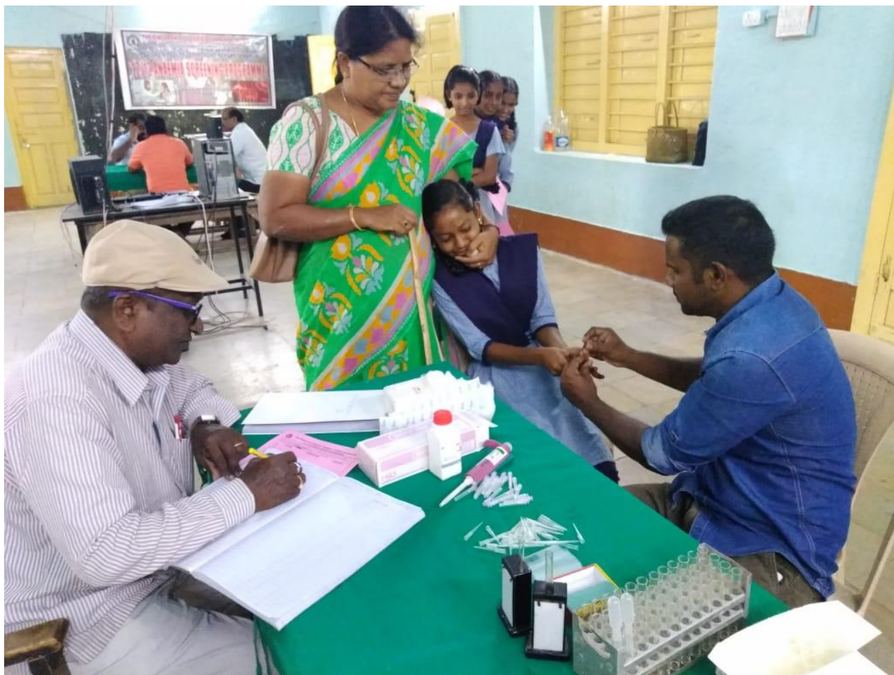
Doctors treating school children during the medical Camp