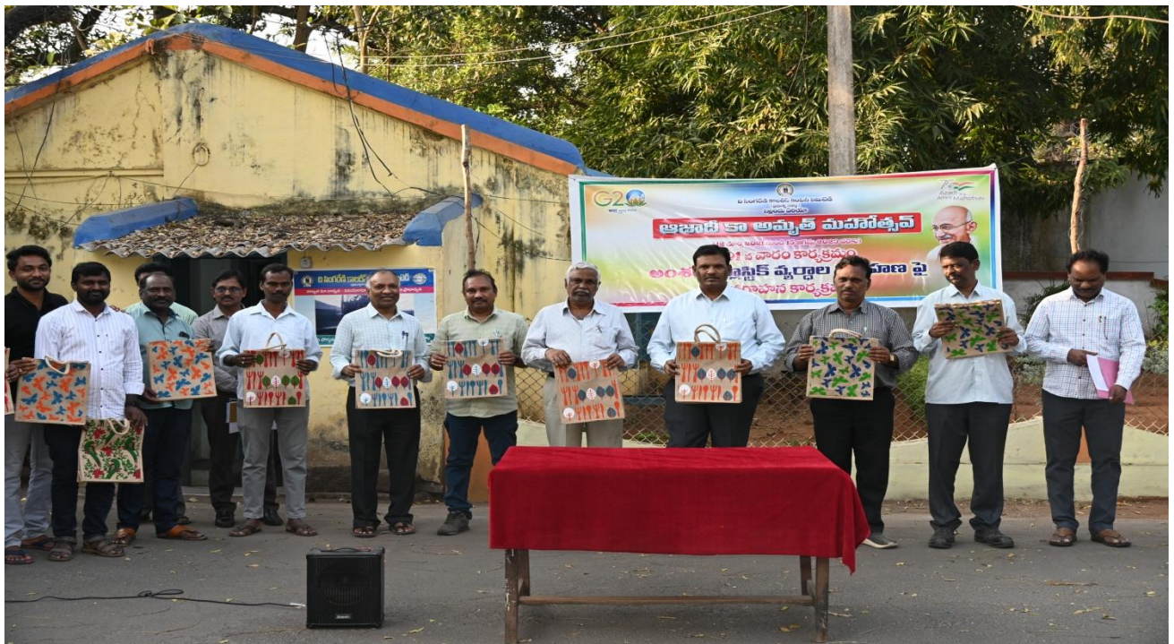
Distribution of Jute Bags in replacement of Plastic during the awareness program