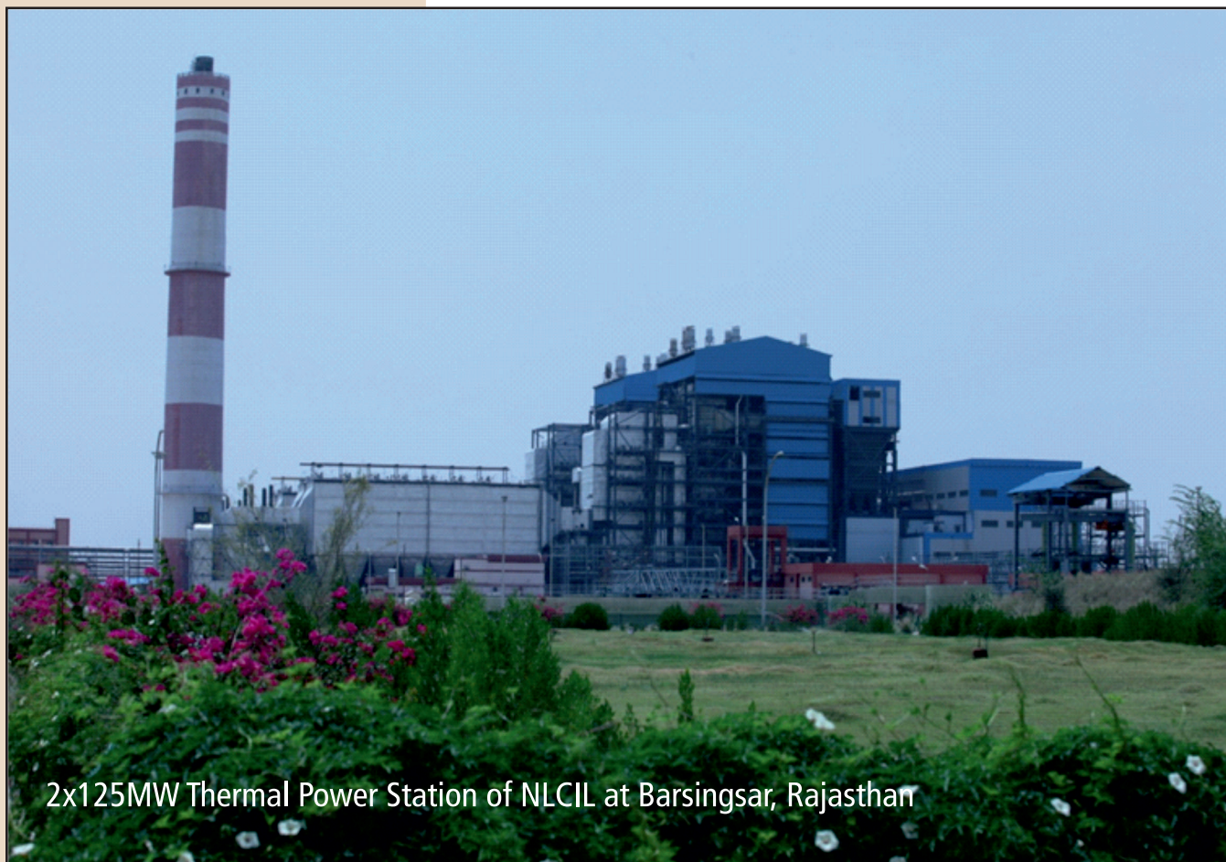
2x125MW Thermal Power Station of NLCIL at Barsingsar, Rajasthan