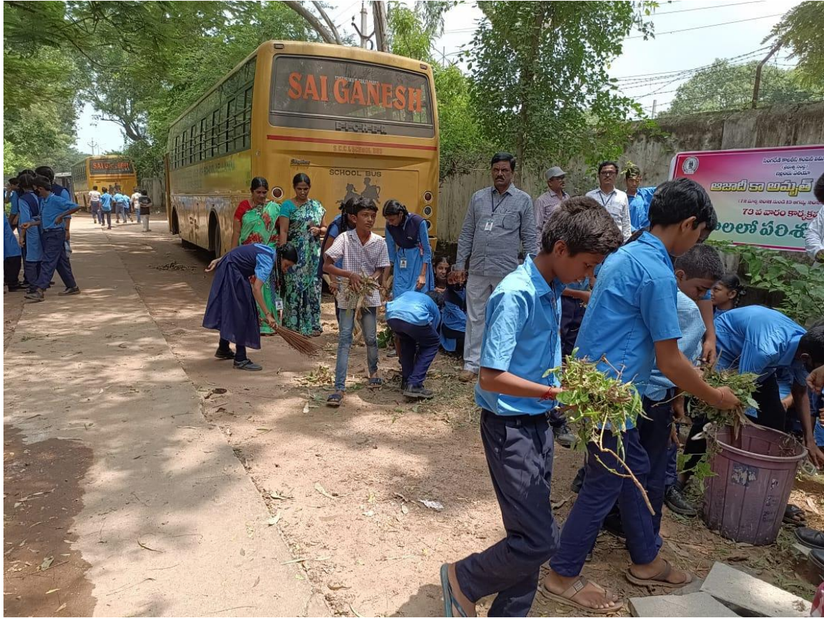
Cleaning programme in SCCL high school of Yellandu area