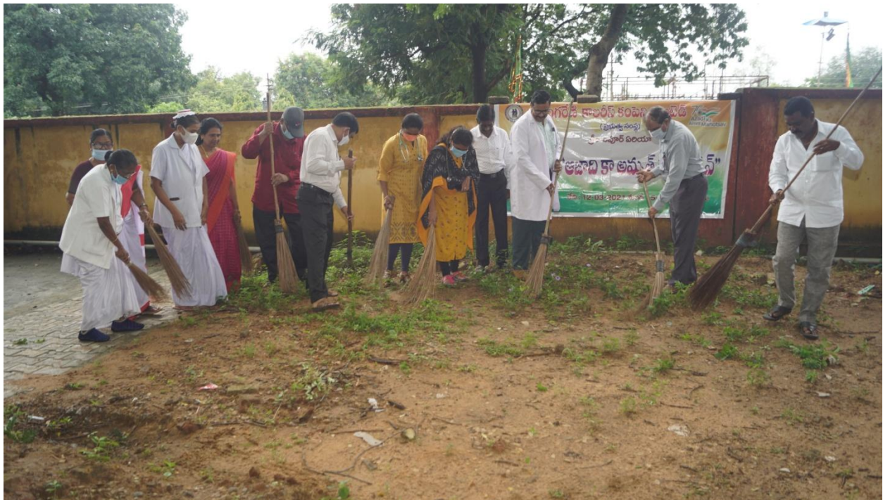
Doctors and staff participated in cleaning programme at SCCL area hospital in Srirampur area