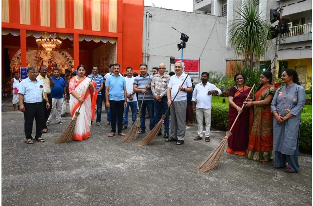
f) Event Date: 02.10.2022