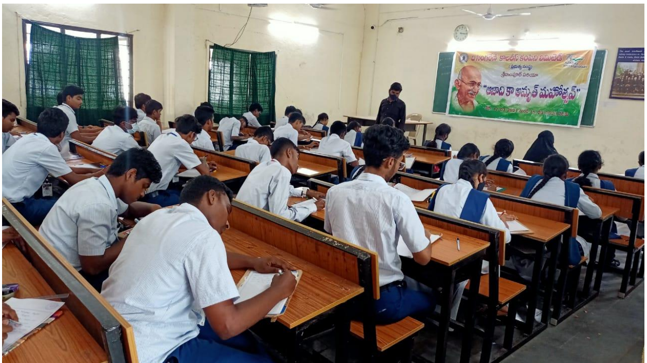
Students participated in essay writing competitions in Srirampur area