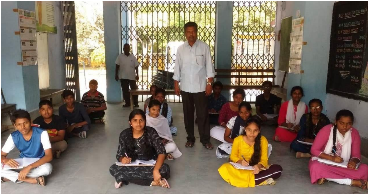
Students participated in essay writing competitions in RG2 area