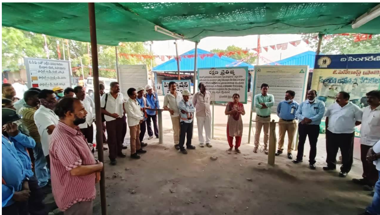
Employees participated in awareness programme on safe drinking water