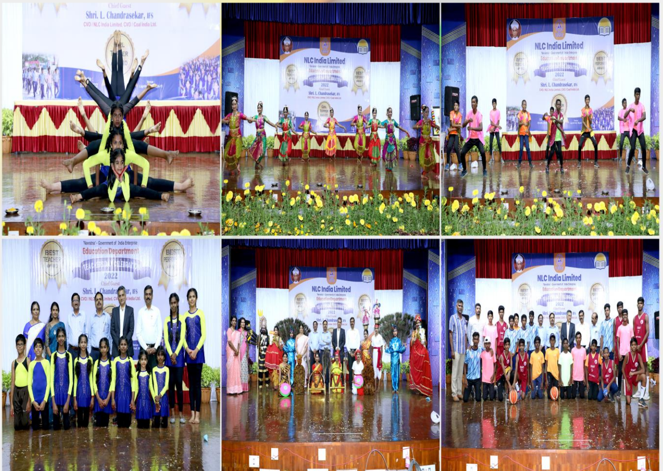
Teacher's Day Celebrations - 2022