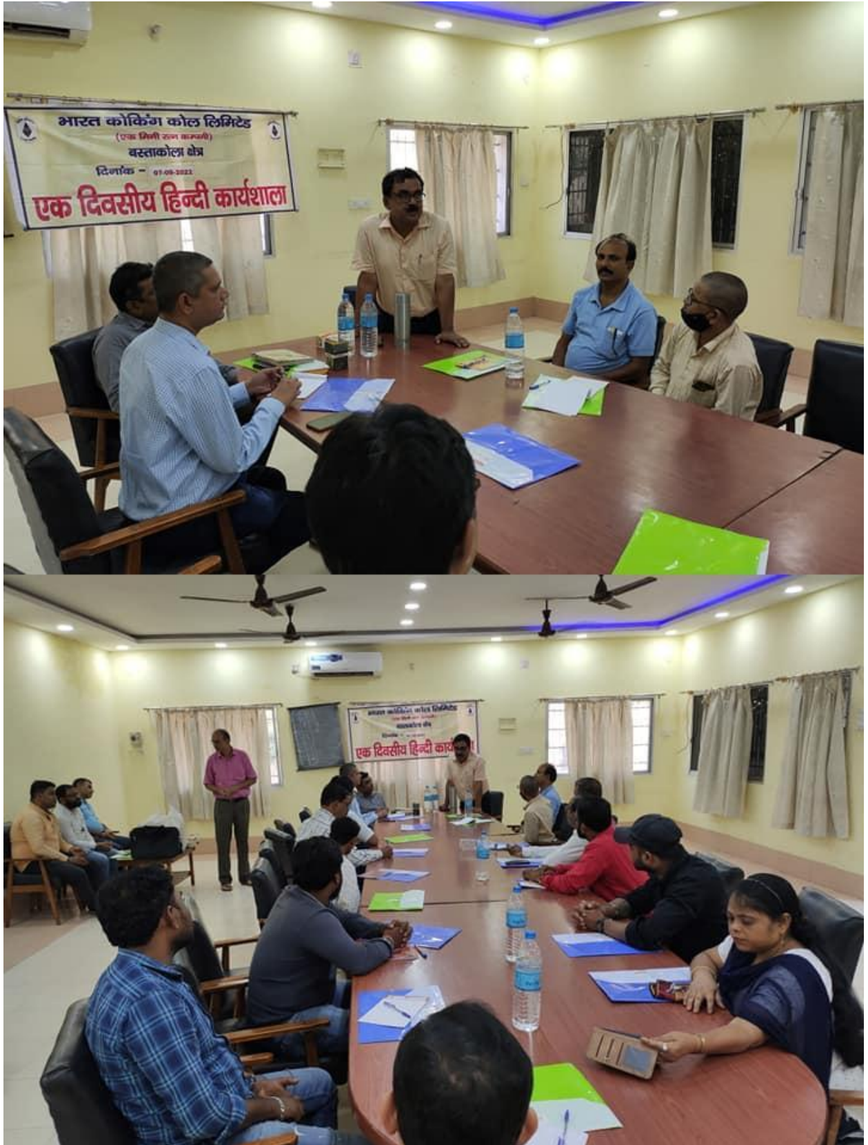
f) Event Date: 07.09.2022