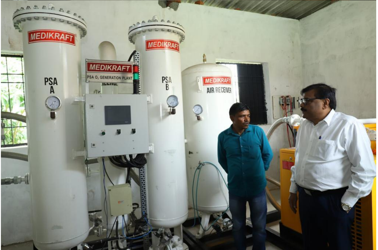
f) Event Date: 05.08.2022