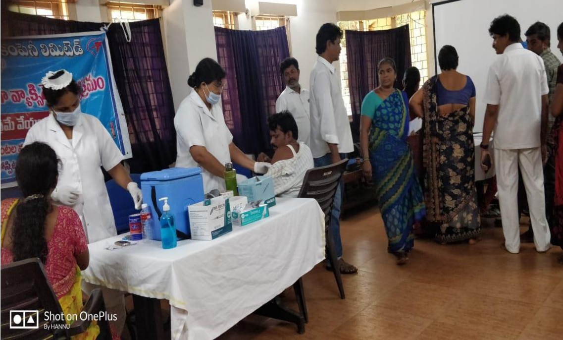
Vaccination camp at in Kothagudem