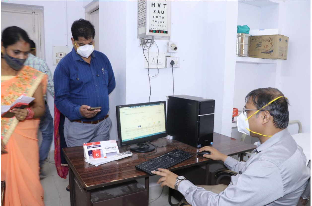
f) Event Date: 05.08.2022