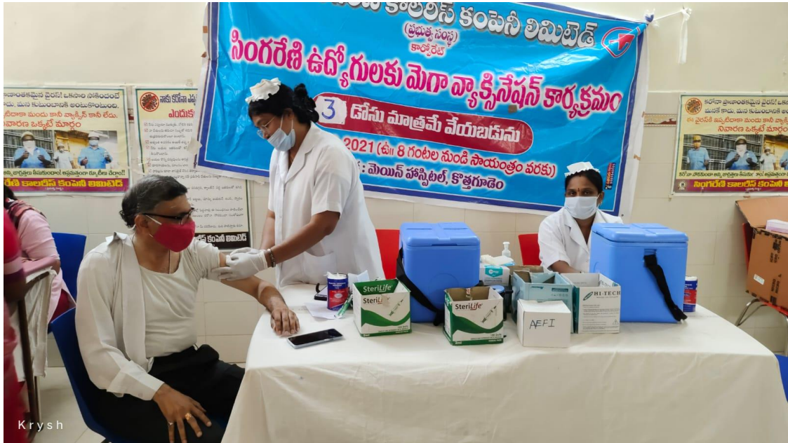
Vaccination camp at Main work shop