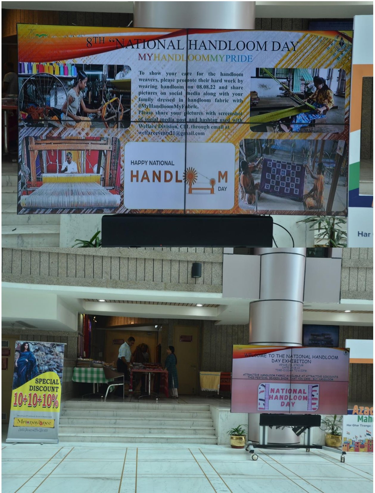
f) Event Date: