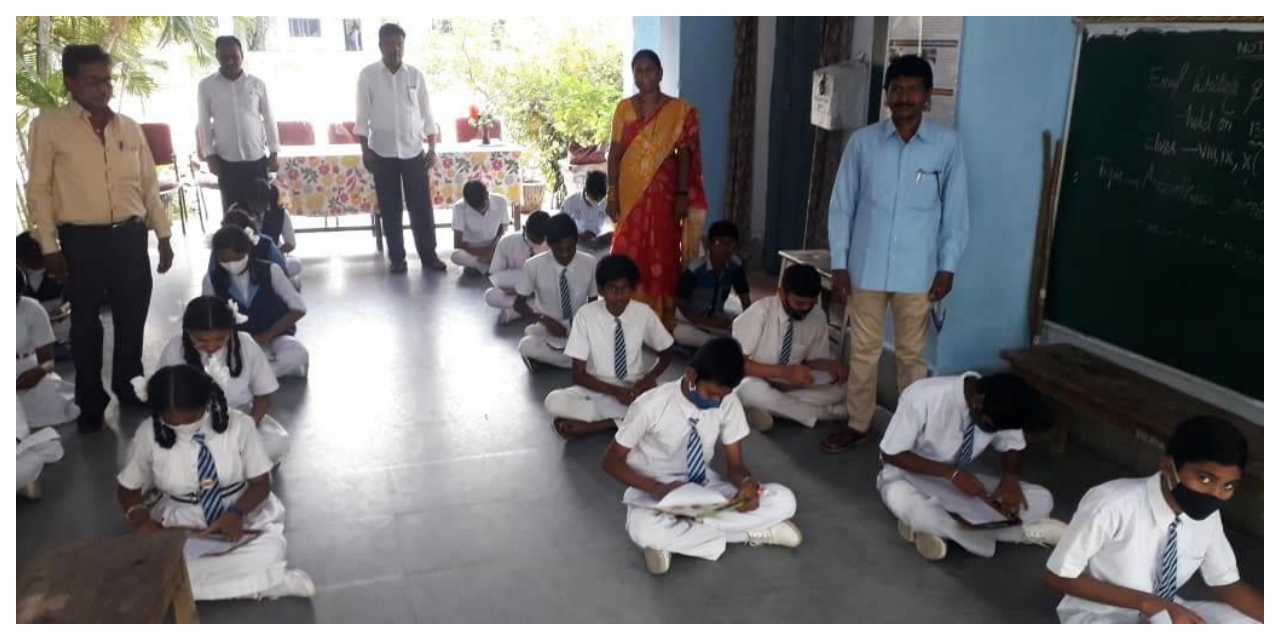
Students participating in essay writing competitions in RG2 area