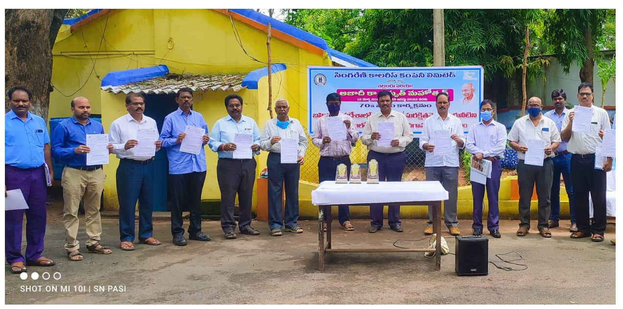
Pamphlets distributed for awareness of clean/safe drinking water