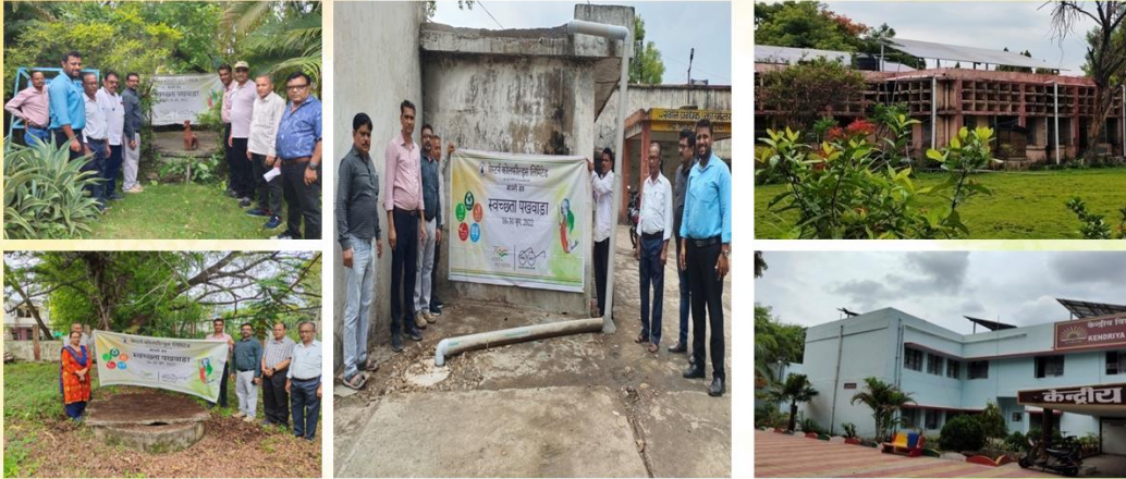
Rain Water Harvesting System at VTC, Nehru Club, Mine Manager Office, AGM Office & Kendriya Vidyalaya, Majri Area , WCL