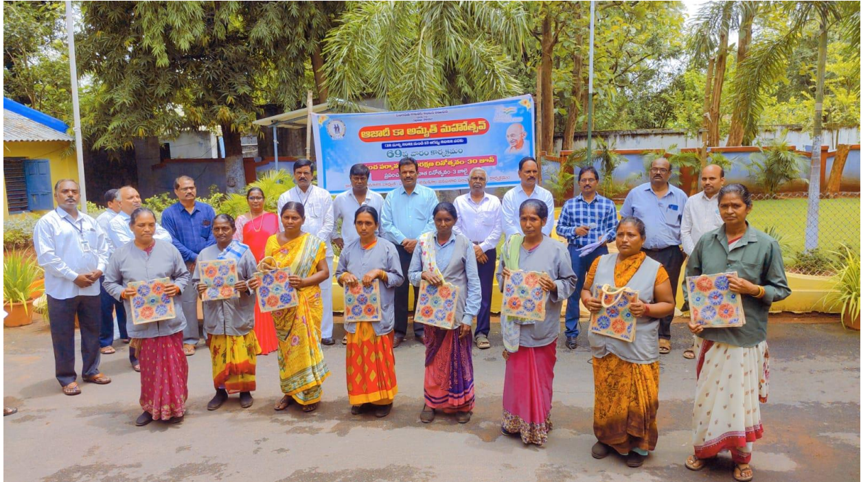
Distribution of jute bags to the employees in Yellandu area *****