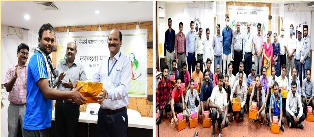
Felicitation of Safai Karmachari at WCL HQ, Nagpur