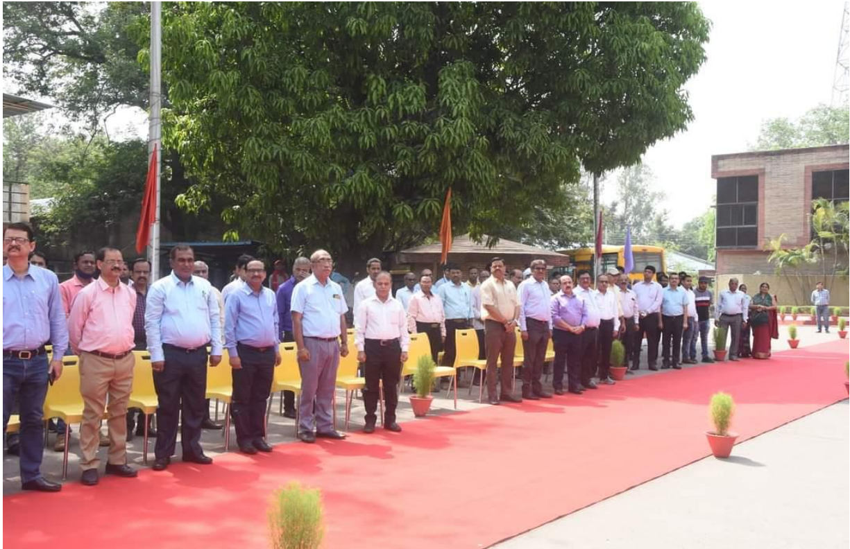
f) Event Date: 02/05/2022.