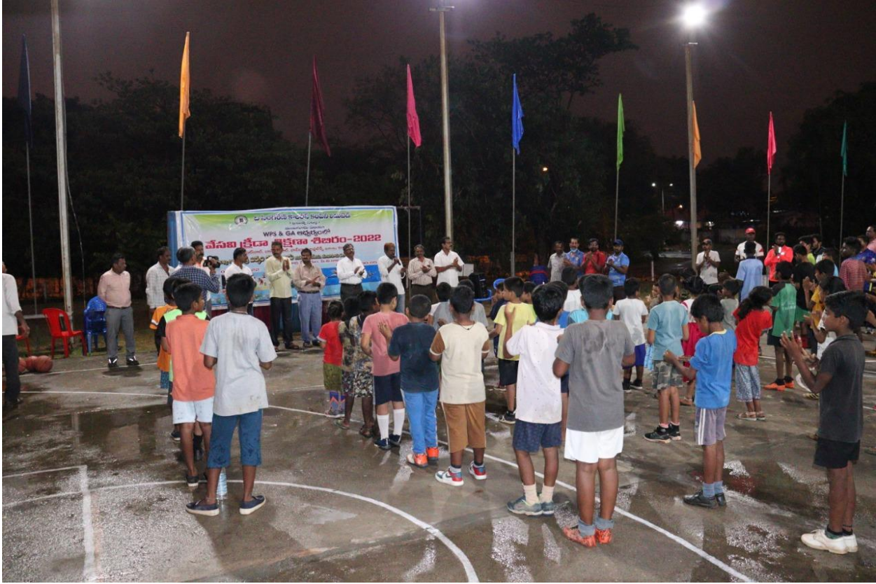
Children participated in Summer Coaching camp