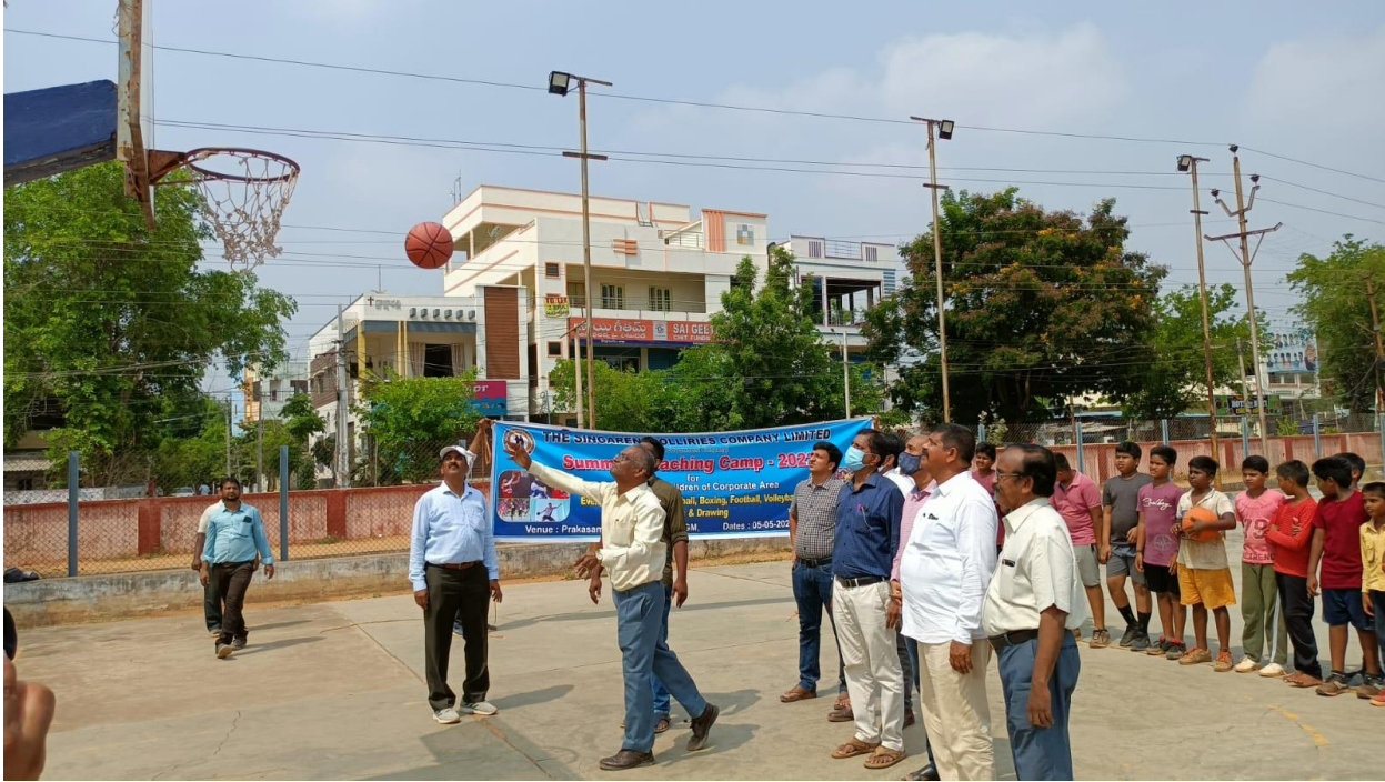
G.M.(Personnel), Welfare & RC inaugurated the Summer Coaching camp