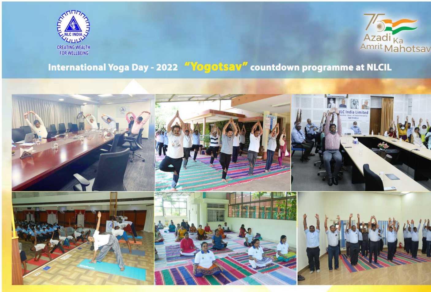
CMD, FDs, senior officials and employees of NLCIL participated in “Yogotsav” countdown programme #67DaysToGo International Yoga Day by performing Common Yoga Protocol organized by Ministry of Coal,Gol

International Yoga Day - 2022 “Yogotsav” countdown programme at NLCIL as a part of "Azadi Ka Amrit Mahotsav" theme for creating awareness as advised by Ministry of Home Affairs, Govt. of India by following the preventive measures as maintaining social distancing, wearing of Mask etc.