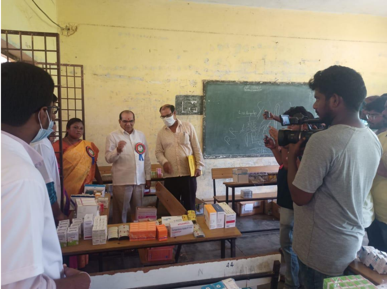
Sri Mechha Nageswar Rao, Hon'ble MLA of Ashwaraopet observing the medicines for serving the villagers on free of cost.