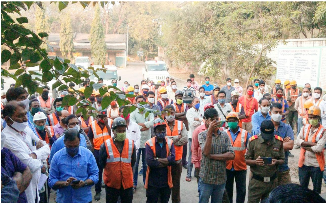
Employees participated in Cancer Awareness Programme