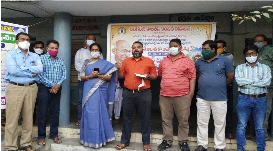
Cancer Awareness Programme in Ramakrishnapur