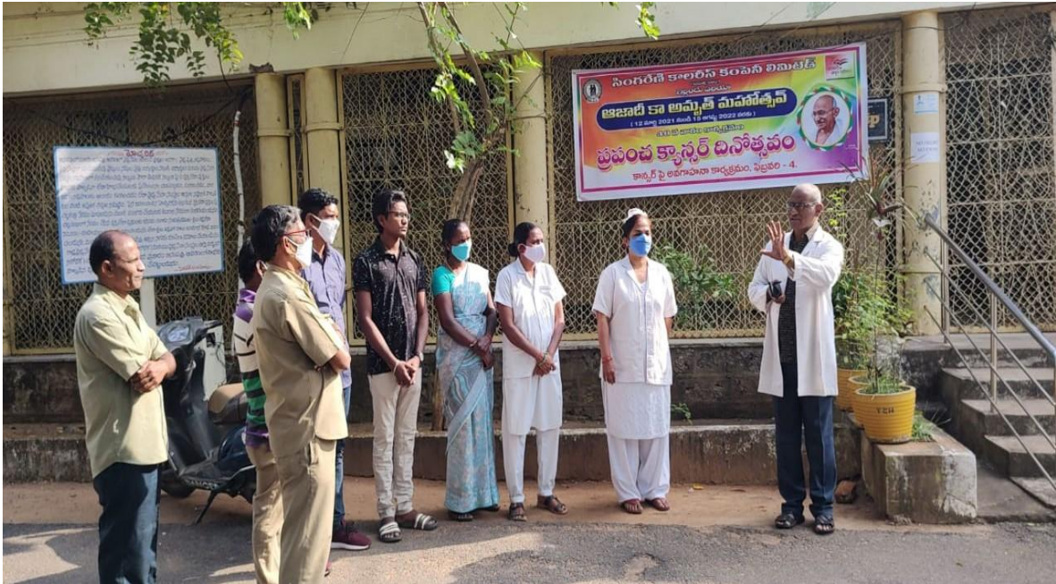
Cancer Awareness Programme in Yellandu