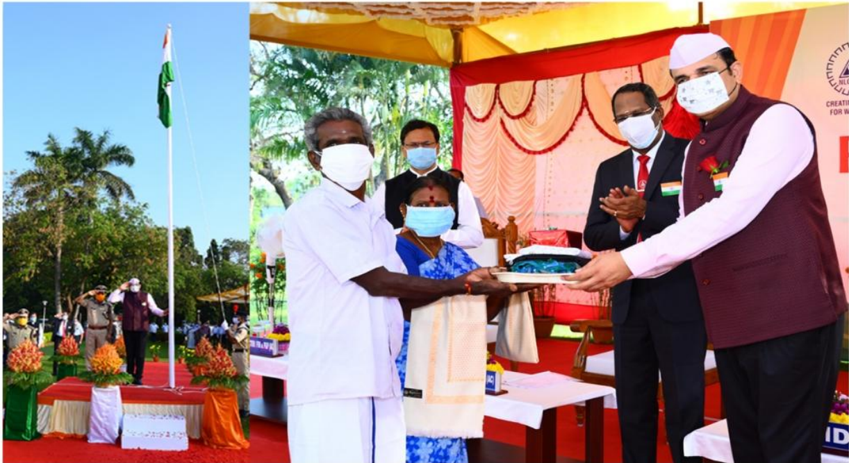
NLCIL - REPUBLIC DAY CELEBRATIONS - 2022

NLCIL organized Republic Day Celebrations as a part of "Azadi Ka Amrit Mahotsav" theme for creating awareness as advised by Ministry of Home Affairs, Govt. of India by following the preventive measures as maintaining social distancing, wearing of Mask etc.