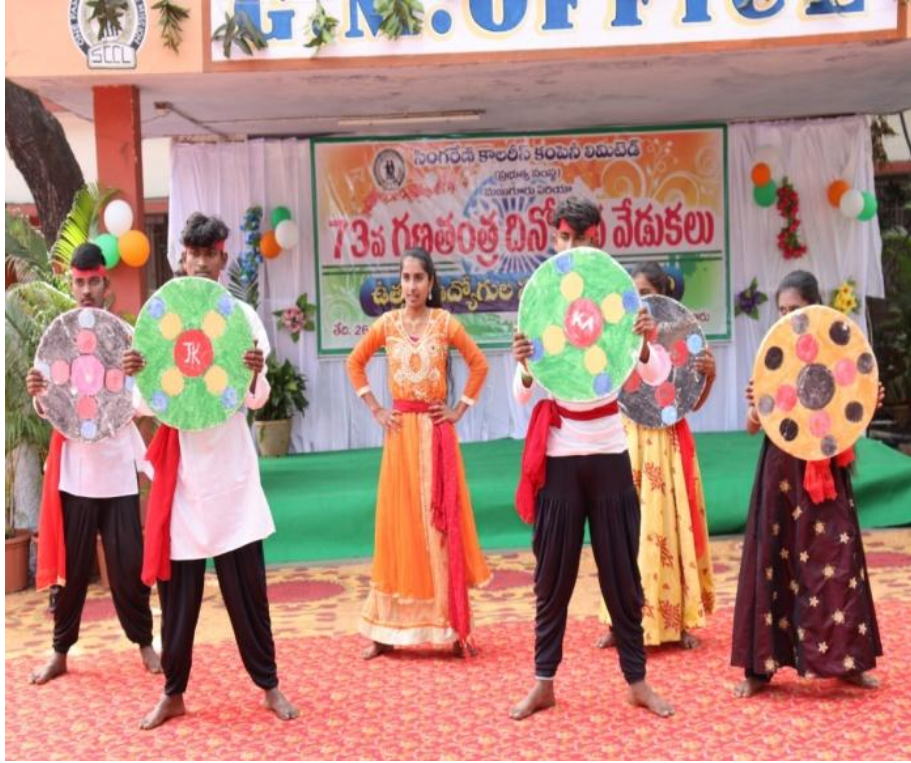
Cultural programmes in Manuguru Area by Students on eve of Republic Day