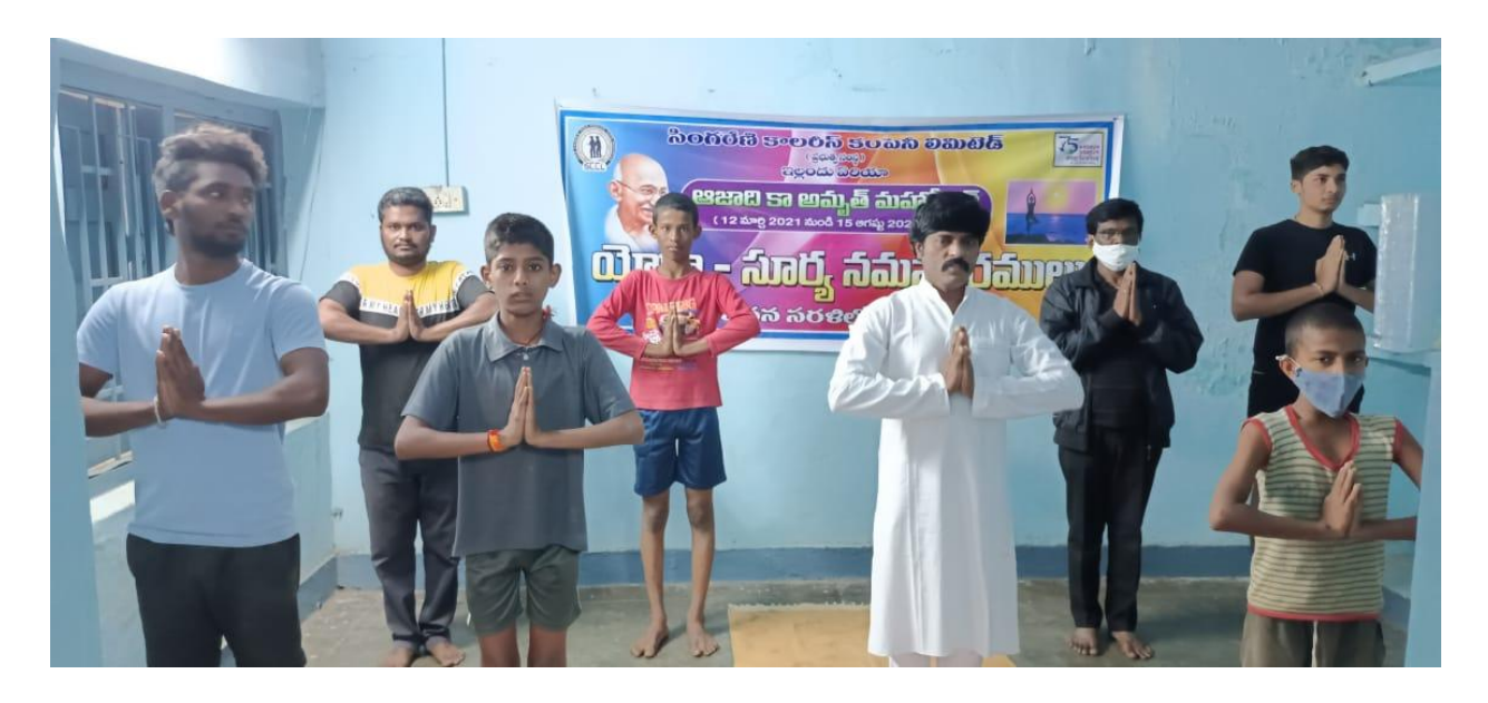
Employees and Students participated in Surya Namaskar in Yellandu Area