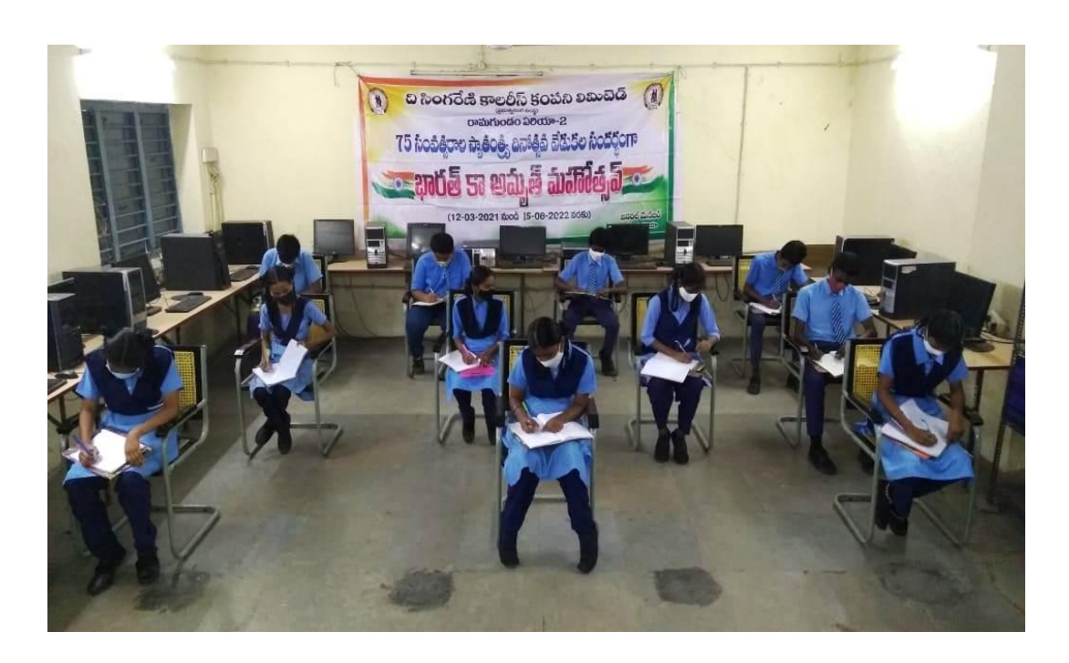
Students participated in Essay writing competitions on eve of Energy security- Celebrations of National Youth Day