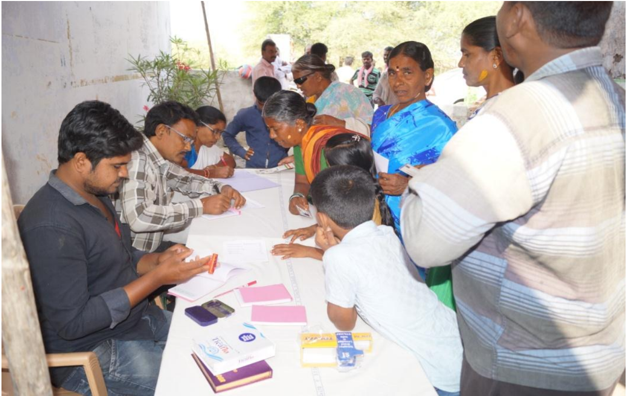
Free distribution of medicines to the Project affected villagers in RG 3 Area