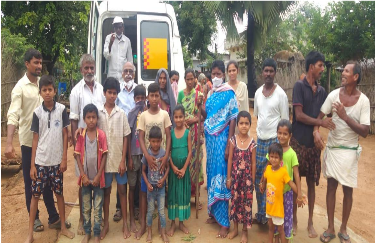
Health awareness camp organized in Yellandu Area