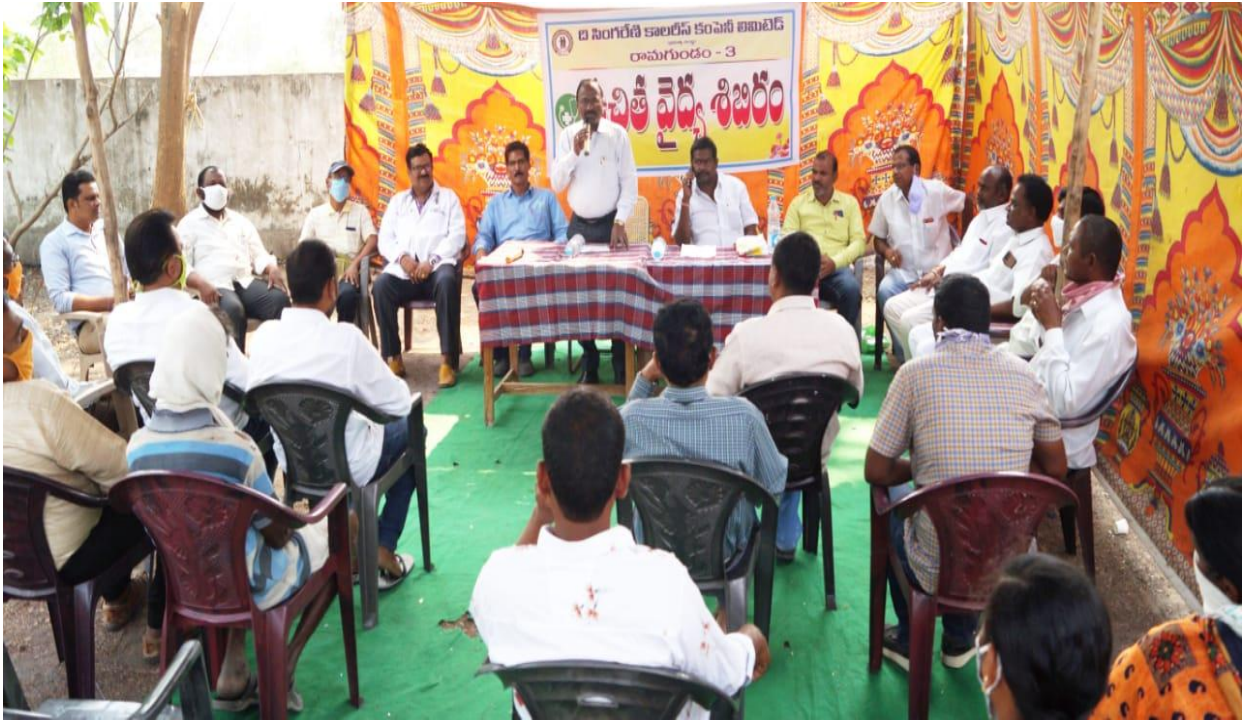
Medical Officer conducting Health awareness camp in RG 3 Area