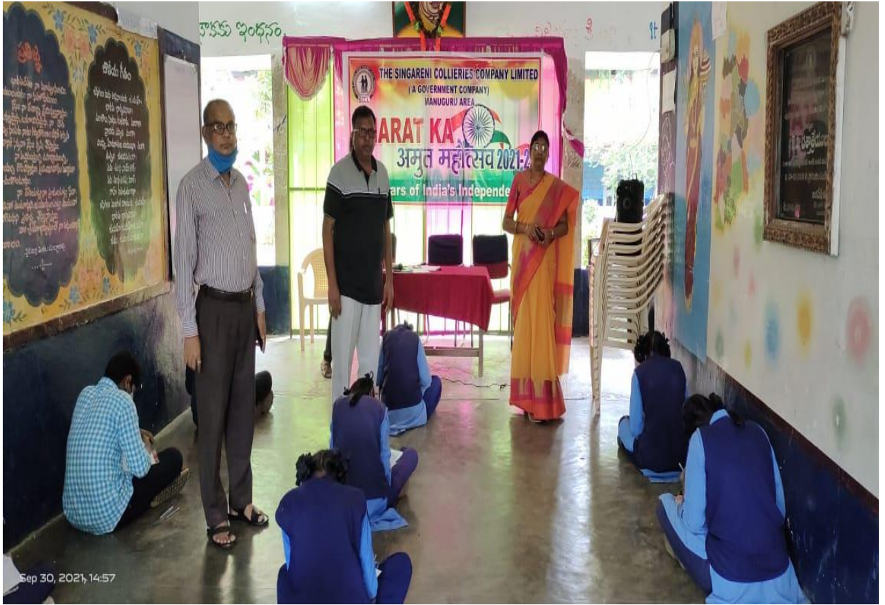
Essay Writing competitions organized in Manuguru Area on Freedom Struggle of India