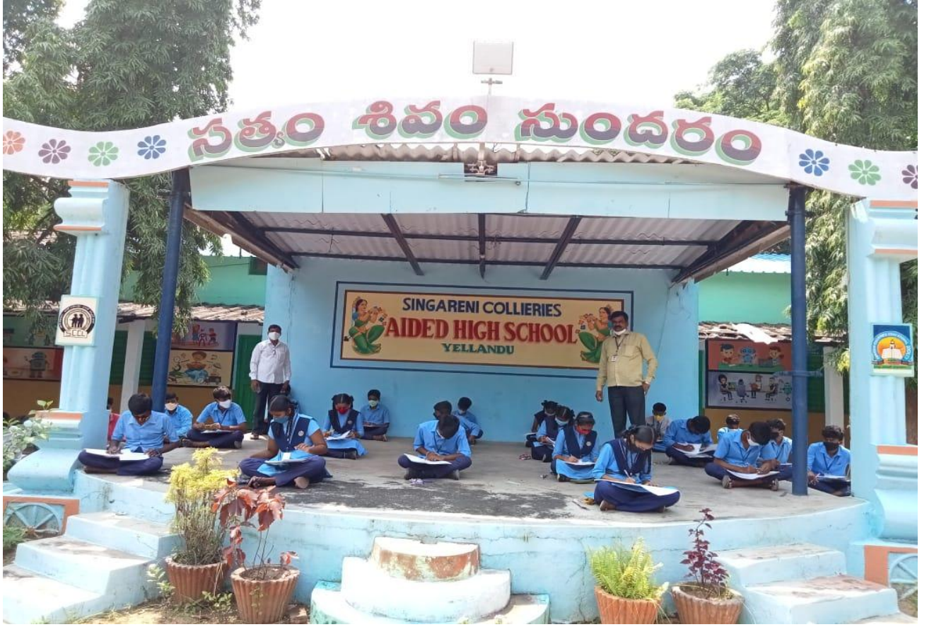
Essay Writing competitions organized in Yellandu Area on Freedom Struggle of India