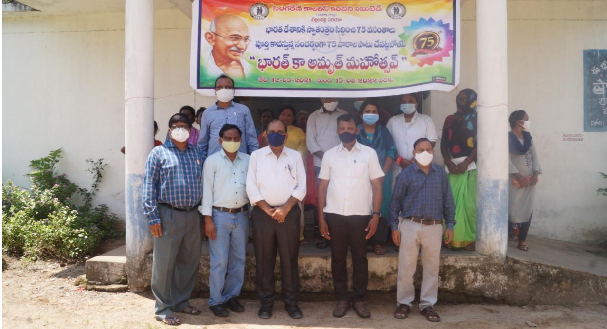
Medical Camp arranged as part of Azadi Ka Amruth Mahosav Program at Sundilla Village of RG 1 Area