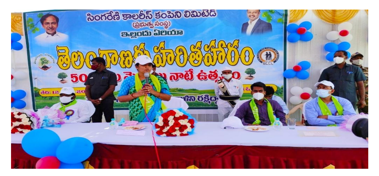
Addressing by Hon'ble MLA Smt. Banoth Haripriya