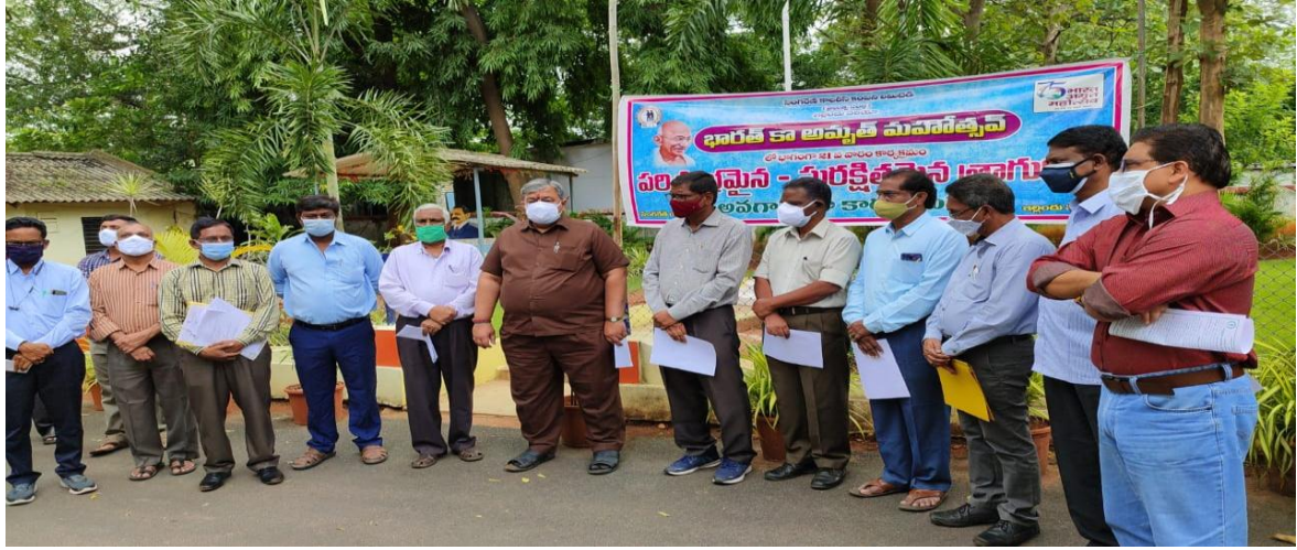
Gen.Mgr , Yellandu Area delivering lecture on clean/safe drinking water at GM's Office, Yld