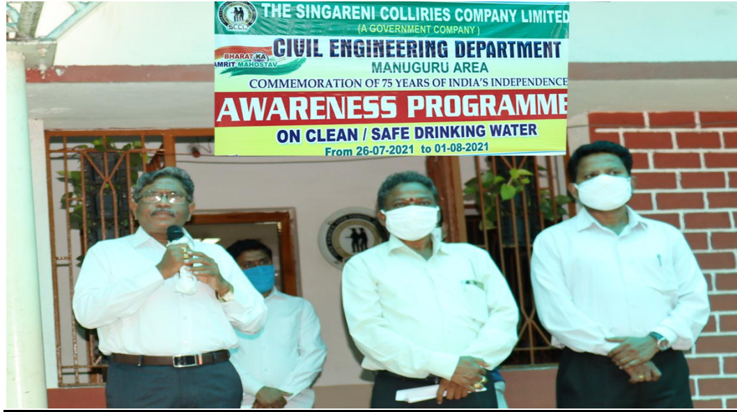
General Manager., Manuguru Area organizing awareness programme on clean/safe drinking water at GM's Office, Manuguru.