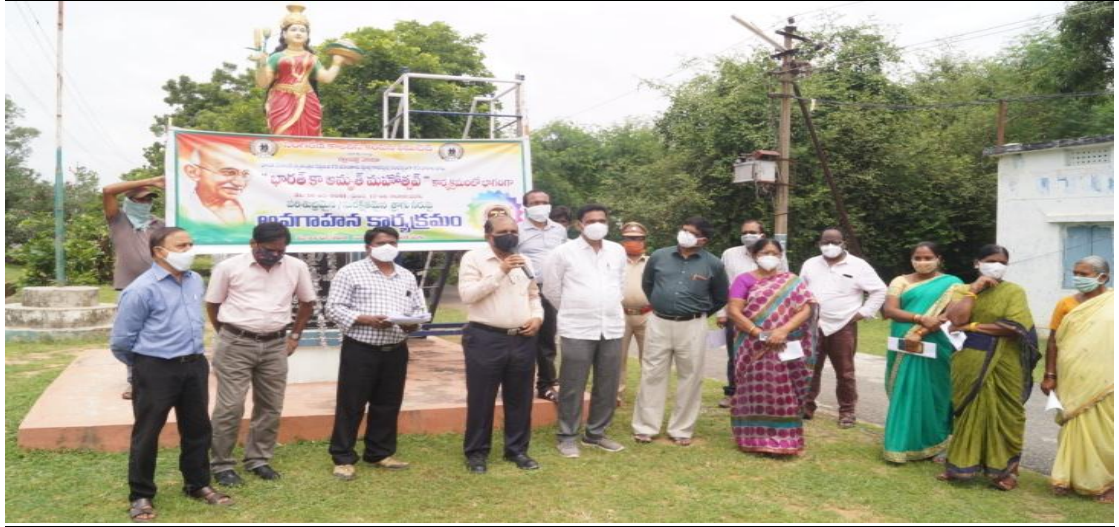
General Manager, Bellampalli Area creating awareness about clean/safe drinking water to staff of GM's Office, BPA