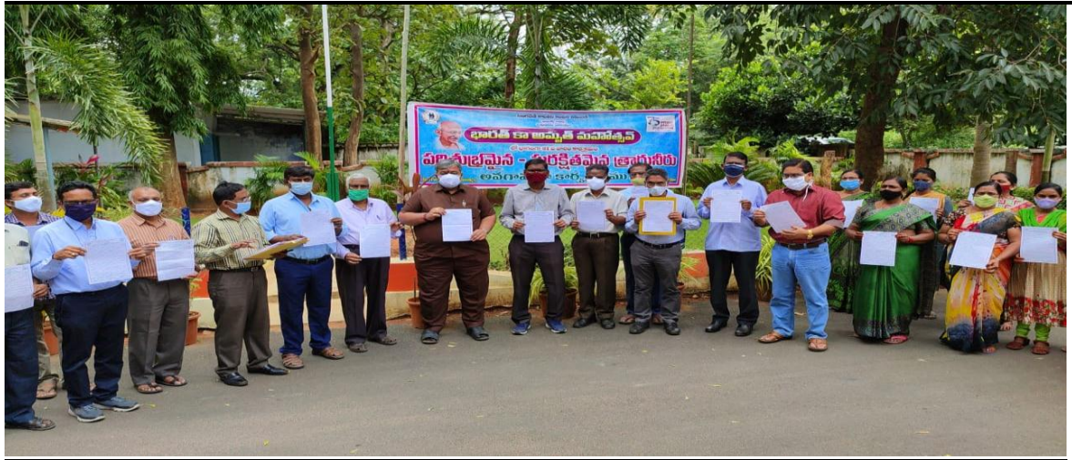
Releasing pamphlet on clean/safe drinking water at GM's Office, Yld area