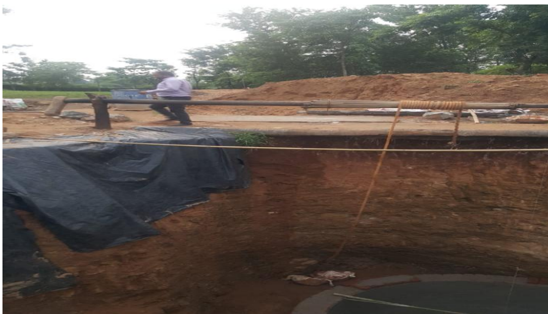
b) ongoing construction of well at Bhalmara panchayat ( Nawadih block).