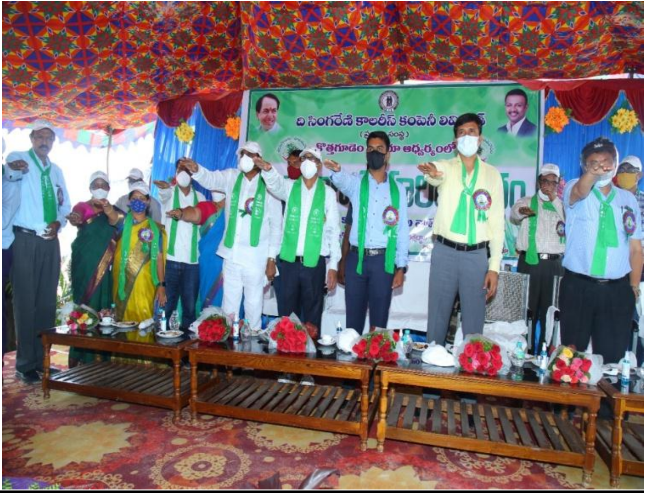
Environment protection pledge at Kothagudem