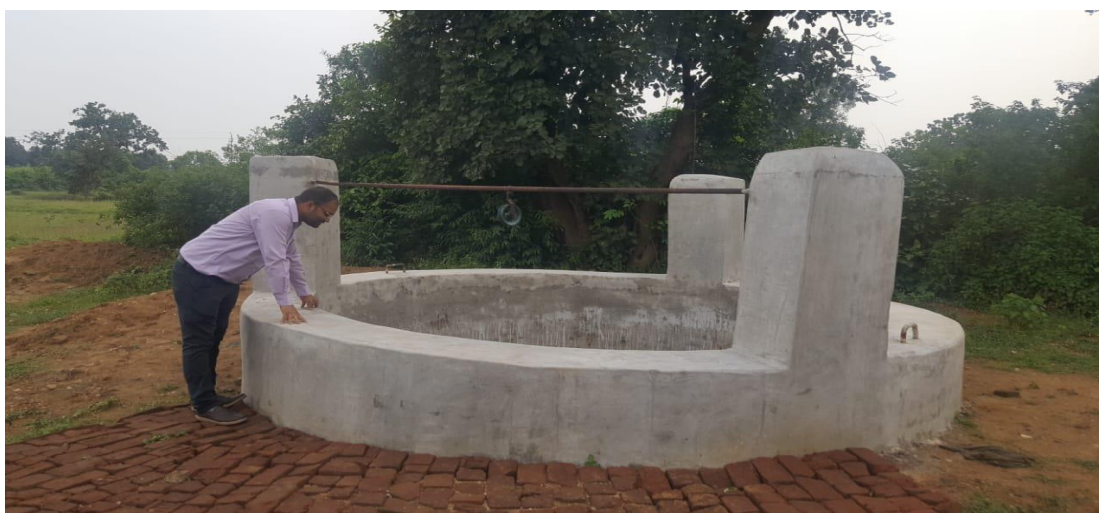
a) completion of well at Turio panchayat in Chandpura block

Construction of Well : Wells are being constructed in Dhoru command area for provision of water for the local villagers/PAPs of the command area. 1 no of well has been completed at Turio panchayat in Chandpura block and 1 no of well in Bhalmara panchayat ( Nawadih block) is being constructed after which the well will be inaugurated under AKAM.