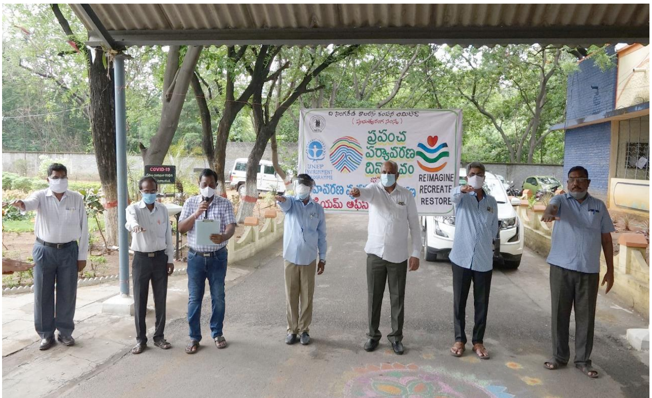
Pledge on World Environment Day by General Manager, RG -2 Area and employees